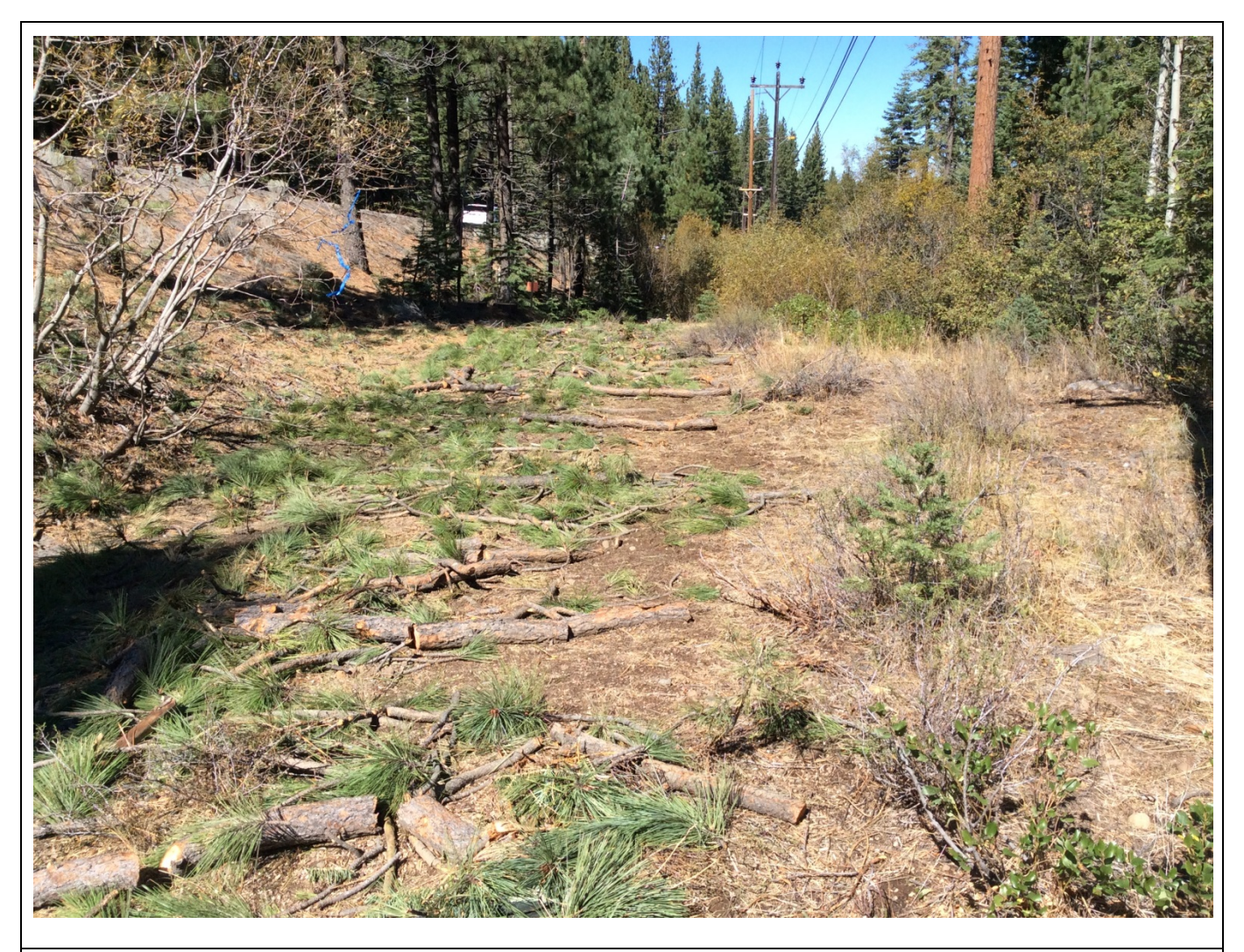
Photo 6: Slash treated and scattered within ROW near Pole #291110, in accordance with APM-SCE-1.