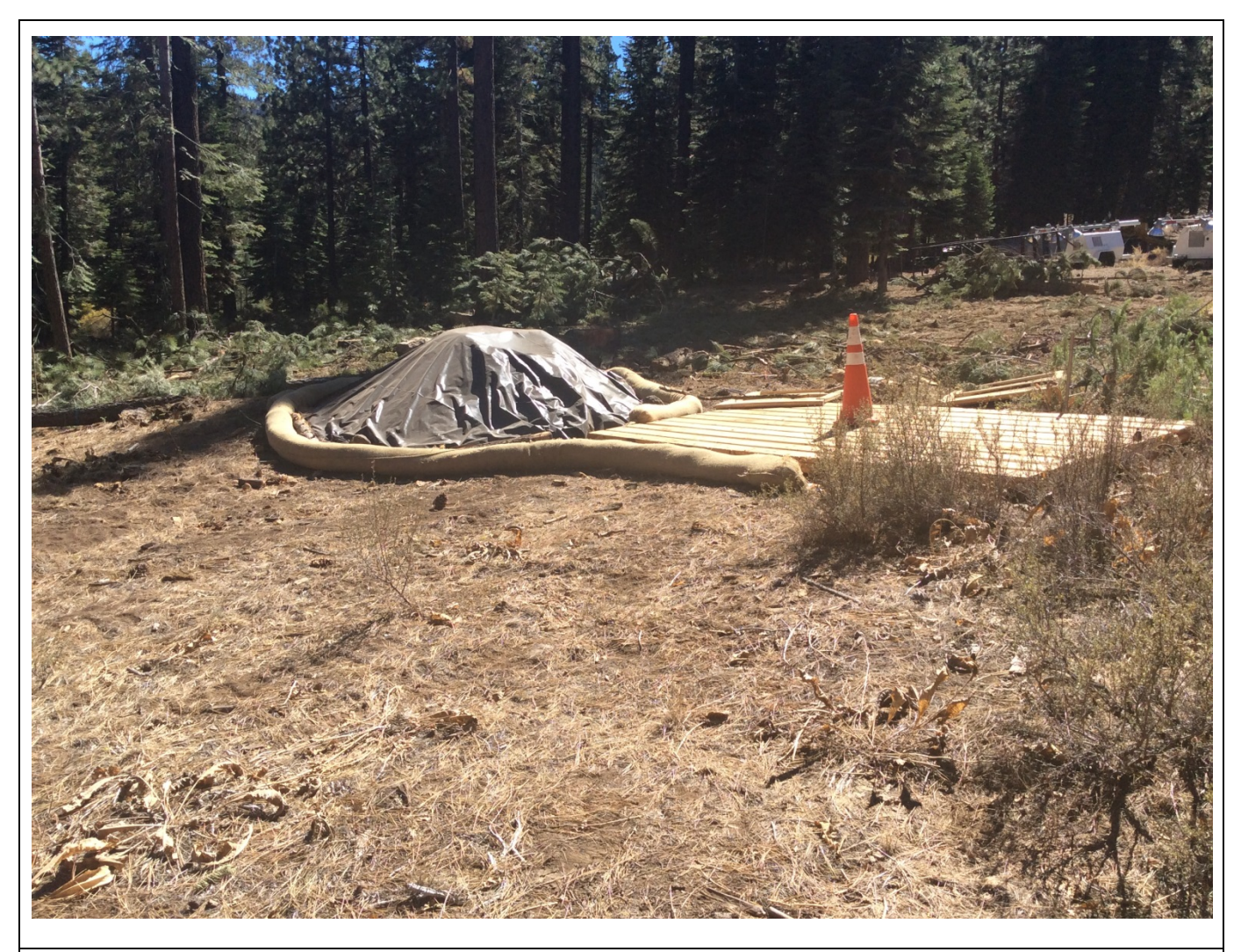
Photo 2: Topsoil stockpiled and covered near Pole #291261, in accordance with APM-BIO-23.