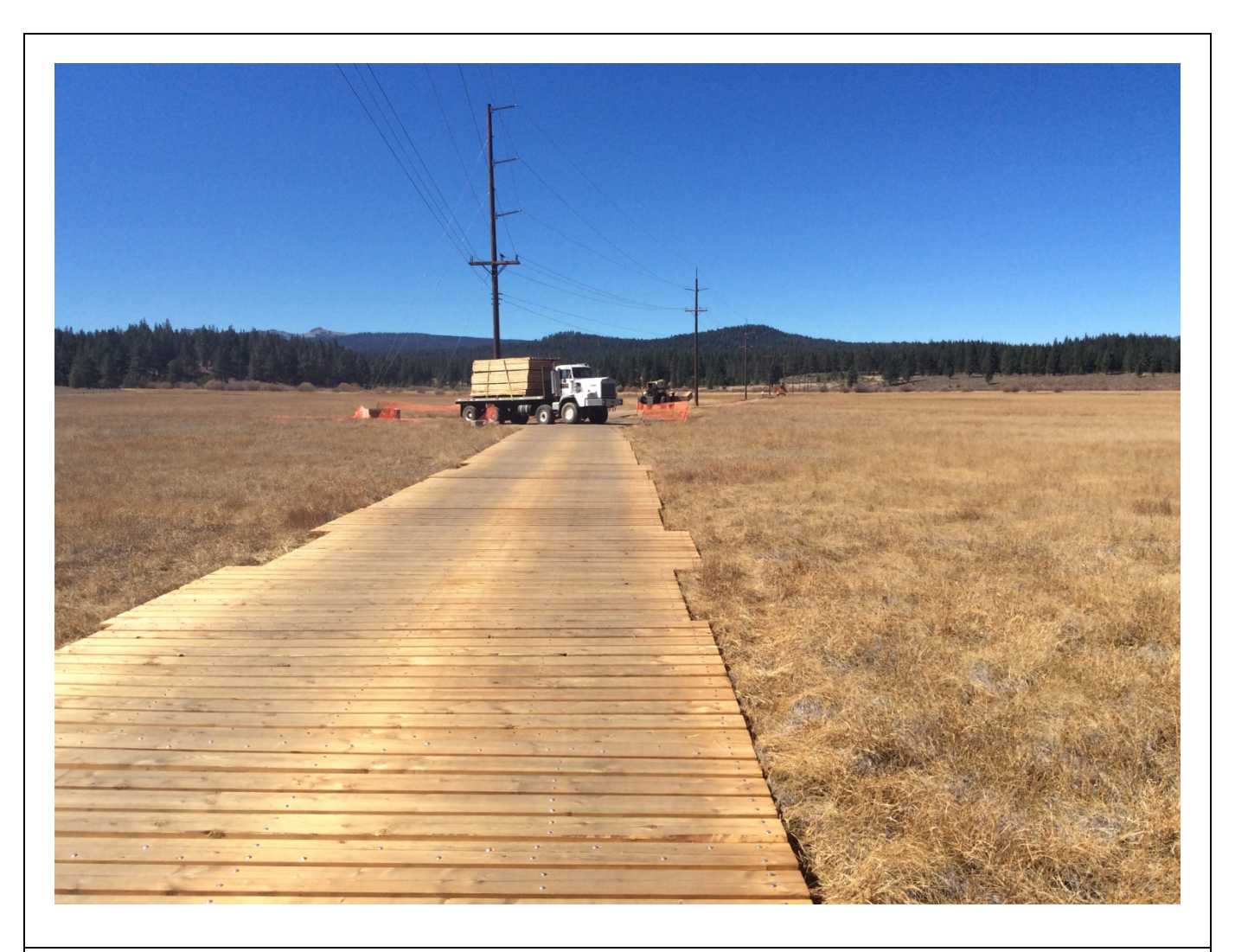
Photo 1 : Timber matting being removed in Martis Valley, biological monitors present during removal activities.