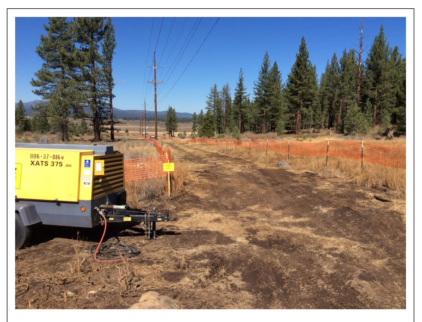
Photo 4: Weed cleaning station with high-pressure air compressor near Pole #291081, in accordance with APM-BIO-6.