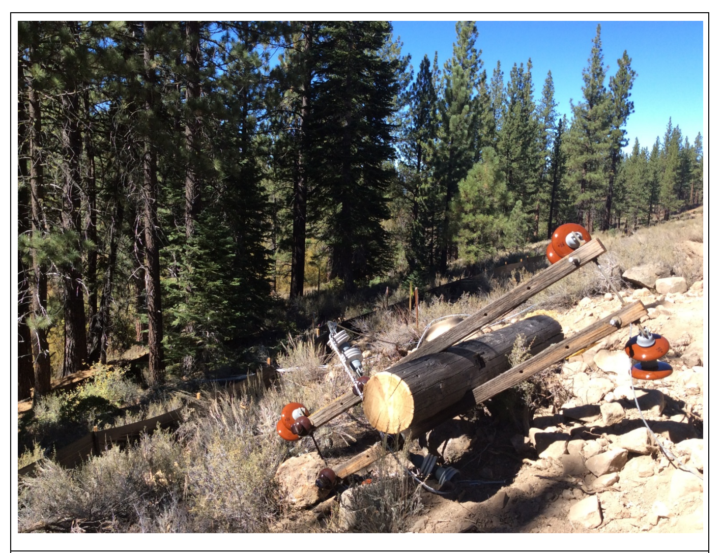
Photo 3 : Pole top removed and staged within the ROW to be dismantled and removed from site, near Pole #291087.